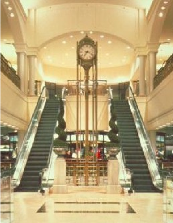
The Marshall Field's Tower Clock