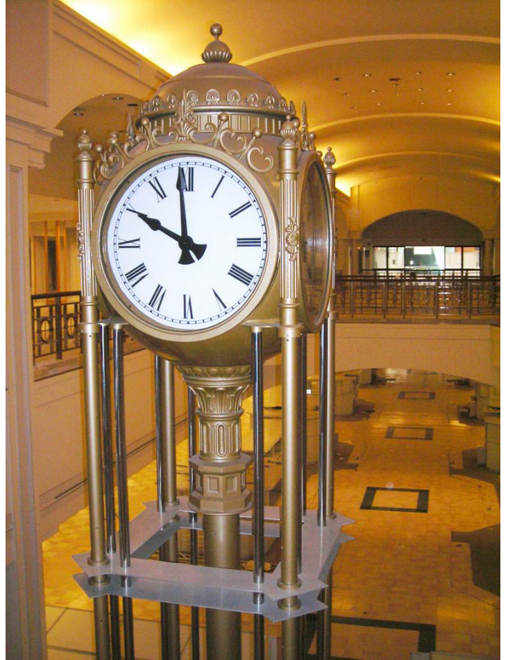
The Four-Faced Clock is a replica of the famous Marshall Field's Clock in Chicago, IL

ARCHITECT: Hambrecht Terrell International MANUFACTURER: I. T. Verdin Clock Company, Cincinnati OH SIZE: 40'H x 68"W X 68"D INSTALLED: 1989 EDITION SIZE: One of a Kind SOURCE: David Verdin, I. T. Verdin Clock Company, Cincinnati OH ORIGINAL PURCHASE PRICE: $146,000.00 CURRENT PRODUCTION COST: $250,000.00 ASKING PRICE: $120,000.00